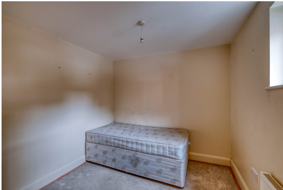
Seacole House, Birchfield Road, Redditch Ground Floor